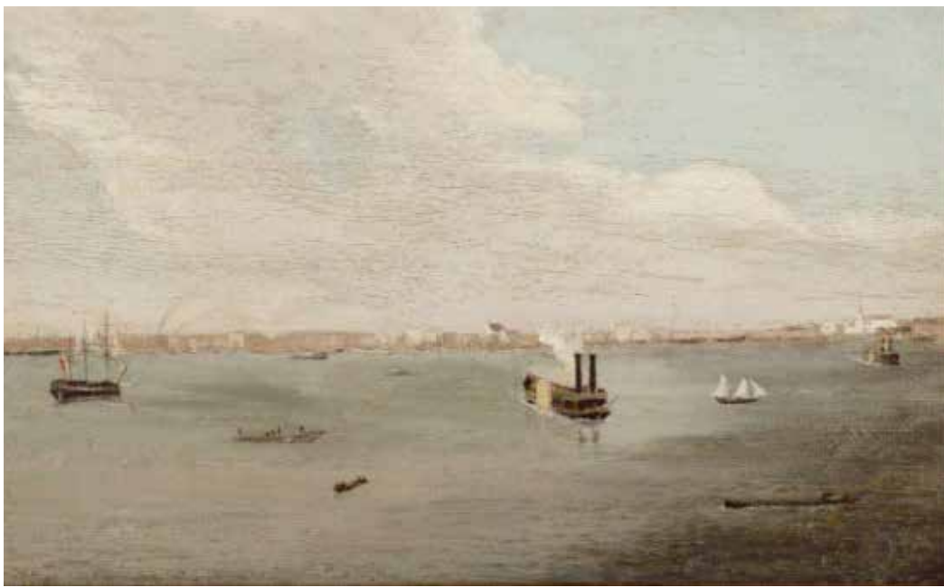
NEW ORLEANS, LOUISIANA: ARRIVED JUNE 10, 1830

“The location of New Orleans is ideal for a commercial city. [...] There are two distinct cities divided not by some river, or district, or other similar object, but by the type of buildings, customs, language and class of society. [...] Napoleon sold it to the United States for ten million dollars, and from that time dates the rapid progress of Louisiana. Hence the diversity of customs and manner of living in that city is one of the peculiar characteristics of its population.” 1830 view of New Orleans from Wikimedia Commons.