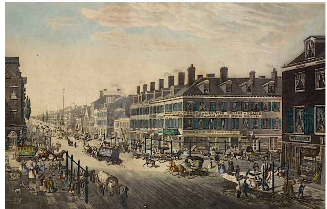
NEW YORK, NEW YORK

“In Pittsburg ocean-going vessels are built, and it seems as something out of a fairy tale to see such things being done at such a distance. Perhaps the day will come when our own Rio Grande of the North will see steamships coming down to carry the products of Chihuahua to London or Bordeaux. [...] There are Germans, English, French, Irish, Scots, in short all that wish to live by the fruits of their industry.” Pittsburgh in 1830, courtesy Carnegie Library of Pittsburgh.