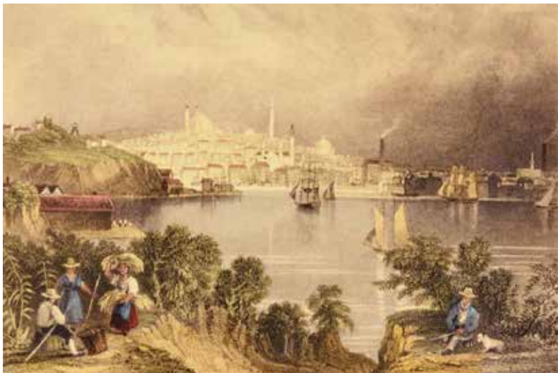
Tornel marveled at Baltimore's industry, including its extensive gas lighting system. While this view is fanciful, it gives a sense of the awe Tornel felt about the city.

After he returned in 1831, Tornel published his observations in a book. His time in the United States soured him toward Mexico's northern neighbor. He continually heard talk of annexing Texas and other Mexican territory. His mistrust of U.S. intentions later led him to pursue a hard line against the United States, particularly during the Texas Revolution, when, as Mexico's Minister of War, he published a decree branding the mostly U.S.-born rebels as pirates instead of soldiers--thus subject to capital punishment. Tornel, after serving in several Mexican governments, particularly those led by his close friend Santa Anna, died in Mexico City in 1853.